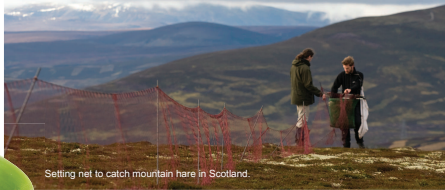
Setting net to catch mountain hare in Scotland.