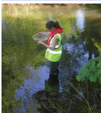
Freshwater crayfish sampling.

Employers: Consultants can be self-employed, often developing highly specialist skills in a few critical areas or they can be employed by consultancies of varying sizes. They may also combine this role with other employment such as for The Wildlife Trusts, research institutes or universities.